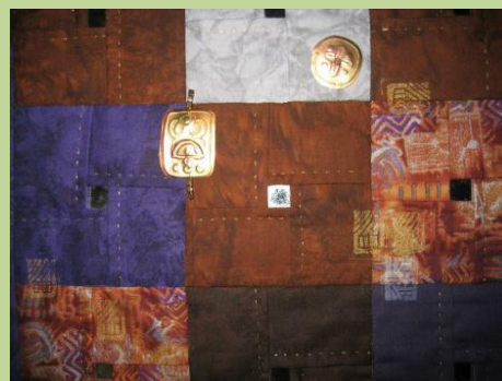
Gudrun Heinz, Xocolatl, Detail, 2008