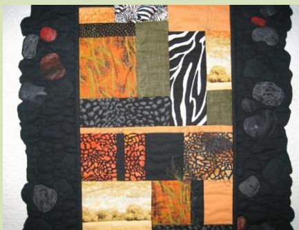
Safari, Detail, 2007