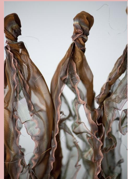
Ursula Gerber Senger, Slow Down 2010